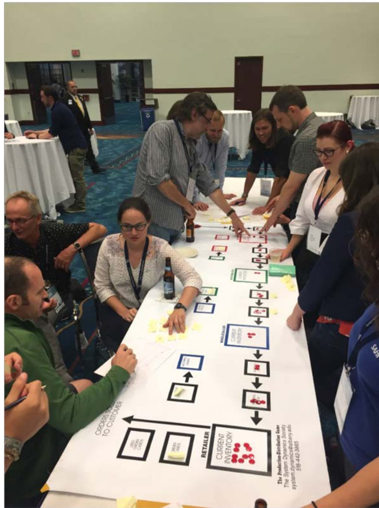
Figure 3. The Beer Game in progress during Games Night at ASC 2017.